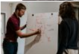
Draw a picture

While this course is fully online and synchronous, an important component of ASL learning in ASL courses via fast learning of the language is through full-immersion in ASL as well as utilizing cultural behaviors within deaf culture. All conversations, questions, and answers are expected to be in ASL during class (keep this in mind for any synchronous courses in ASL you may take in the future). Students will maximize their learning potential by using ASL, written English, gestures, or other means necessary excluding spoken language to convey meaning and communicate with peers and the instructor.