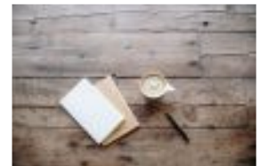
Write it down

Please understand that it is extremely rude and culturally inappropriate to use your voice in an ASL class and especially inconsiderate when Deaf people are present. If a student interacts uses their voice in class, the instructor will ask the student to leave the class for a short period of time and will allowed back in. For second time, the student may be asked to leave for a longer period of time and might be marked as absent. For the third time, the student will be asked to leave and be marked as absent for the day. If the behavior persist, the students' grades will reflect and action may be taken to remove the student from course. The use of voice in a signing environment can be harmful and distracting to other students' learning. Outside of ASL learning, for clarification on policies, or general concerns/questions, written descriptions through e-mail, notepads, phone notes, etc. may be used to communicate with the instructor.