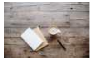
Write it down