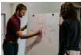
Draw a picture